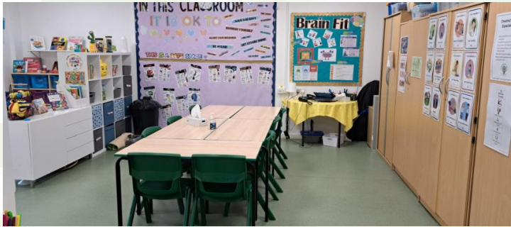
The Chestnut Room

I will still be able to use these areas: